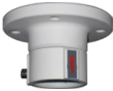
DS-1663ZJ Ceiling Mount