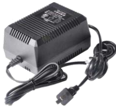
TEAC-66-243000V (EU) MKAC-66-243000U (USA) TEAC-66-243000VB (UK) Power adapter (for outdoor model)