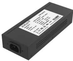
LAS60-57CN-RJ45 Hi-PoE Midspan