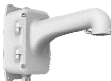
DS-1604ZJ-box Wall Mount with Junction Box